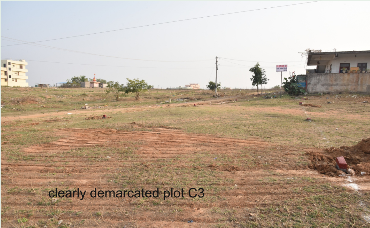
clearly demarcated plot C3