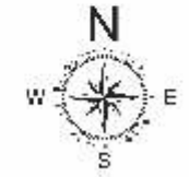
AGRAJA TOWNSHIP - ROUTE MAP